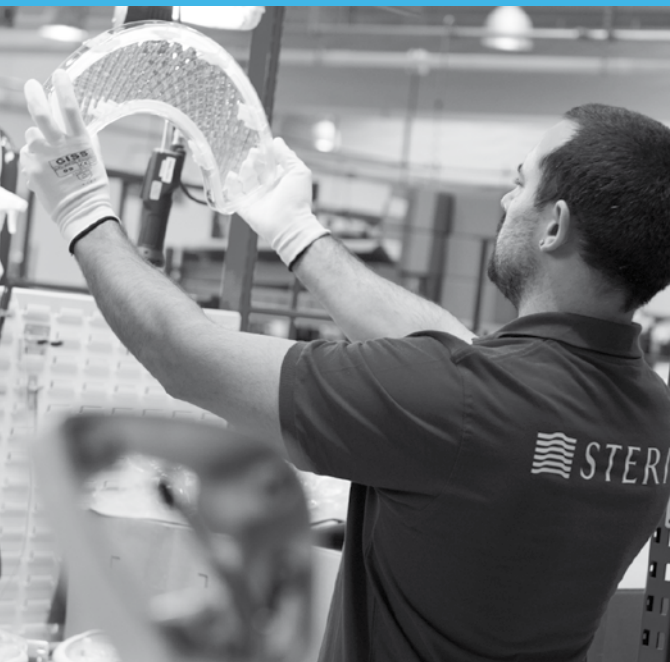
Production unit of our surgical lights (Le Haillan, France)

We enhance safety, the environment, integrity and mutual respect, by supporting our employees, Customers and patients in compliance with all applicable regulations.