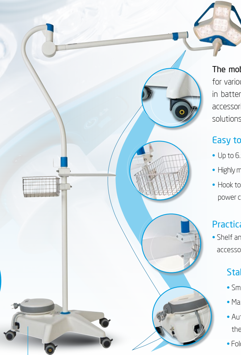
Mobile version with optional batteries, retractable power cord reel, basket and shelf