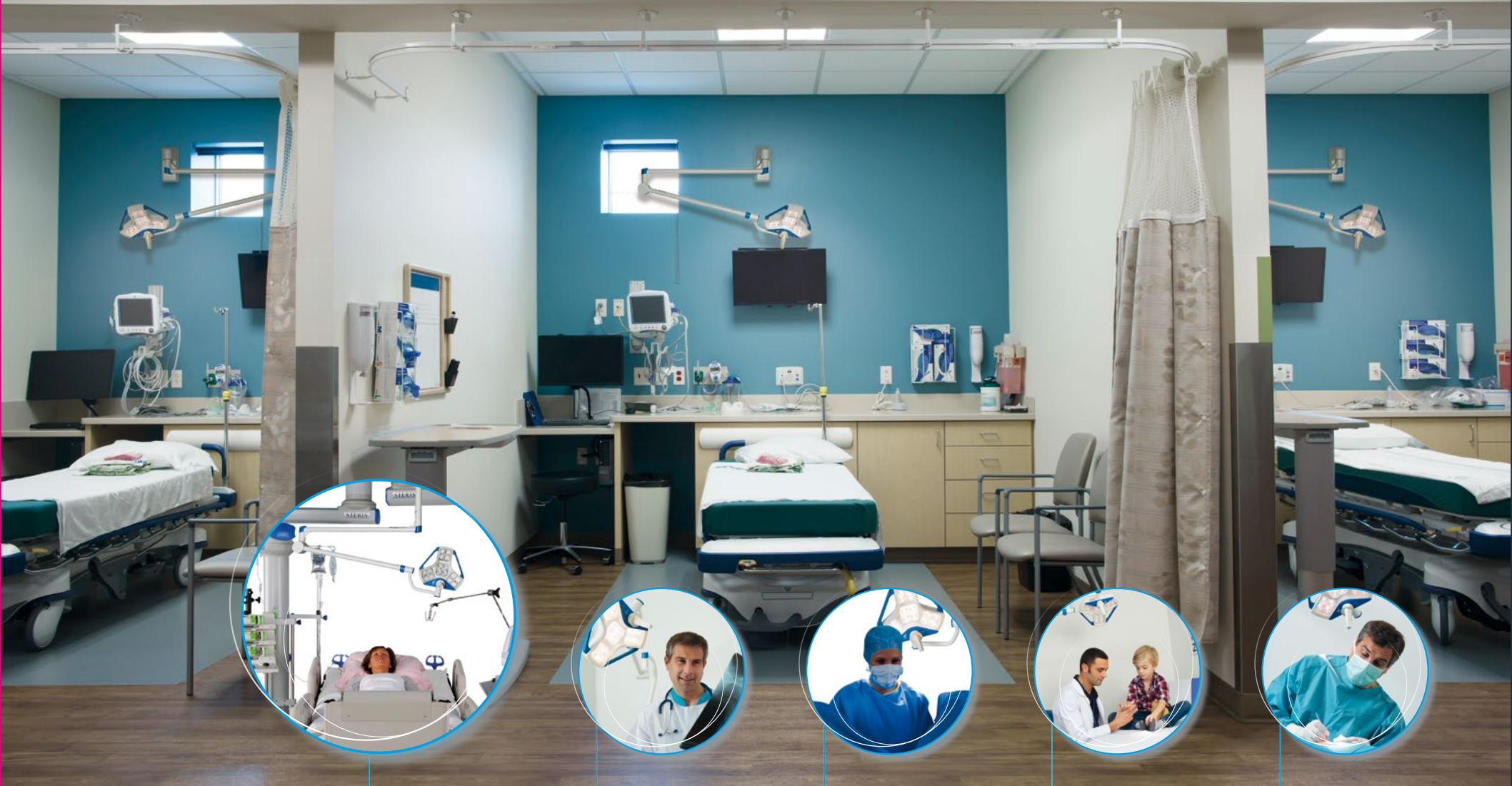
Intensive care units